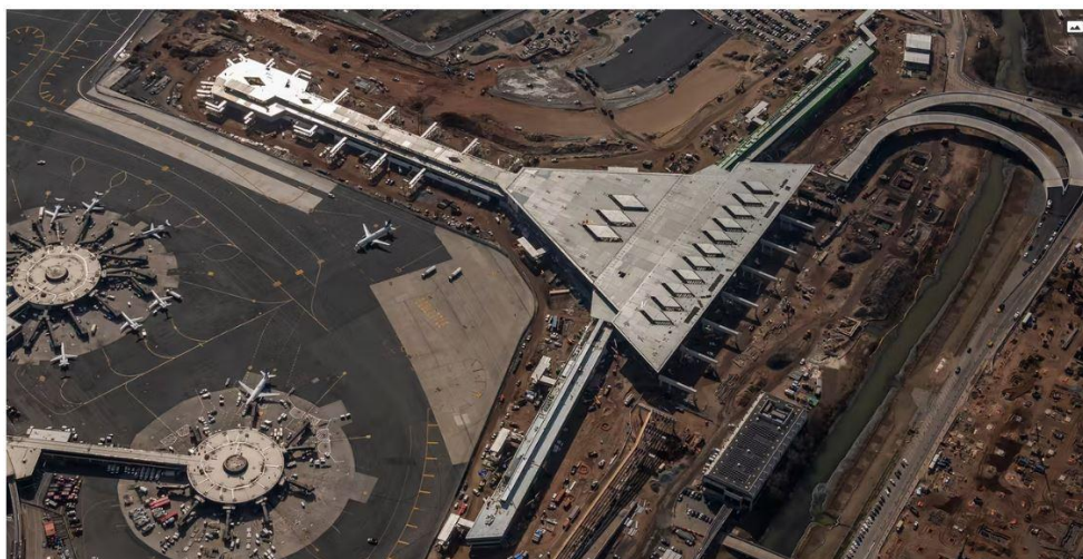
Work on Newark Liberty International Airport's Terminal A, shown here, started before the IIJA. But it's still an example of the types of large-scale transportation projects that the IIJA will fund over the next several years.

"I think a small portion of it [will be] in 2022, but I think it's going to have a larger impact over the following years — 2023, 2024, 2025 — especially with the magnitude and the size of the projects," says Russ Lancey, president and CEO.